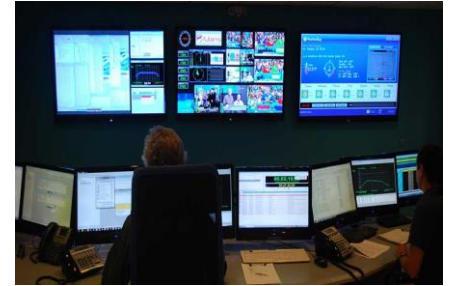
Data, IT & systems