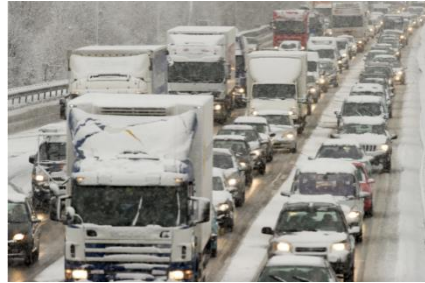
Traffic & weather