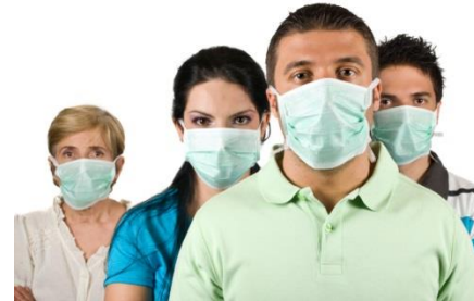
People & sickness