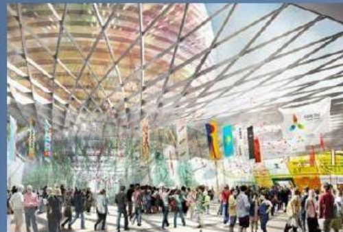
Expo site marketing