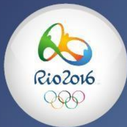
Summer Olympics Rio 2016