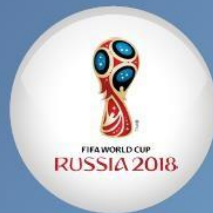
FIFA WORLD CUP, RUSSIA 2018