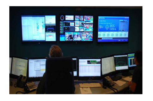
Data, IT & systems