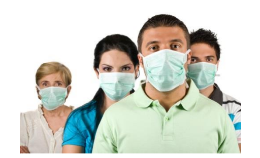
People & sickness