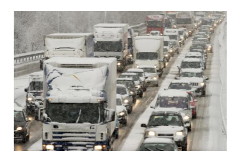
Traffic & weather